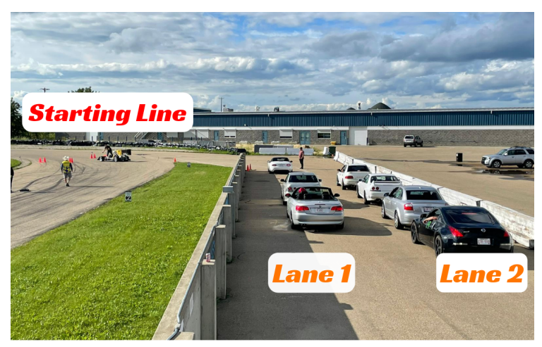
StratoCross Competition Run Staging

All cars in Lane 1 take a run then all cars in Lane 2 take a run. Drivers restage in the same lane after completing a run. A starting line worker will let you know when it's safe to take your run.