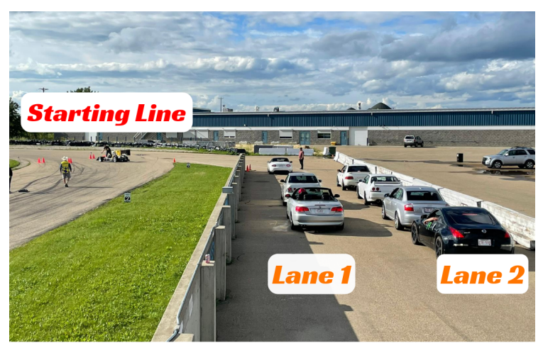
StratoCross Competition Run Staging

All cars in Lane 1 take a run then all cars in Lane 2 take a run. Drivers restage in the same lane after completing a run. A starting line worker will let you know when it's safe to take your run.